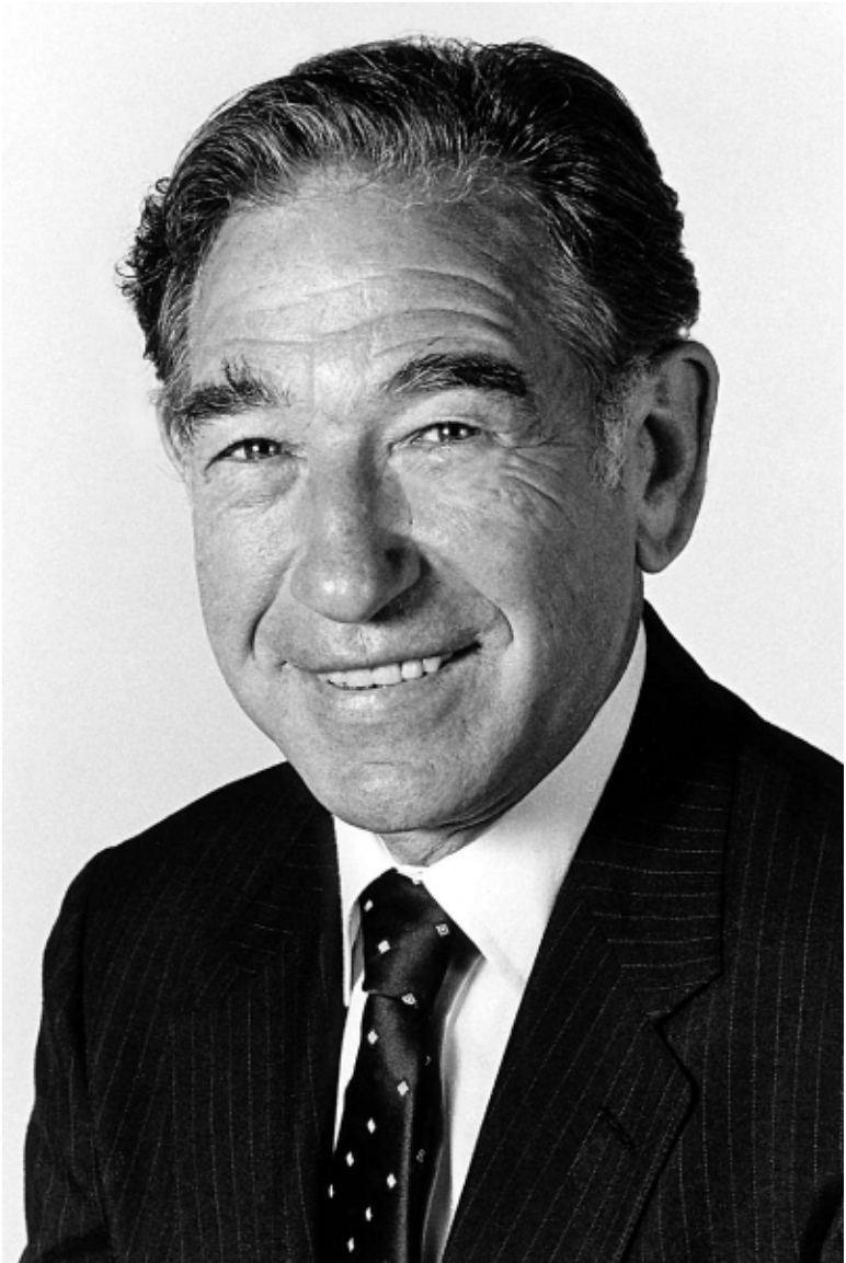
Stanley Cohen, Distinguished Professor of Biochemistry, Nobel Prize in Physiology or Medicine 1986