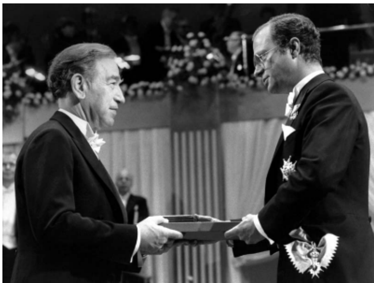
Stanley Cohen receives the Nobel Prize from the King of Sweden, December 10, 1986